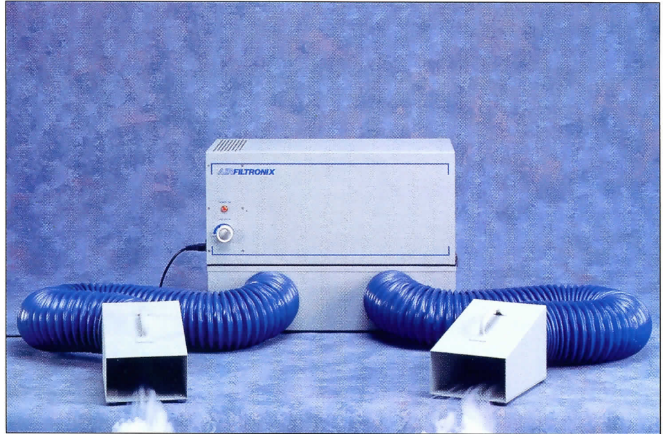
HS-3000A2 - Two Hose Scavenger

Like all Airfiltronix systems, the Scavengers can accommodate a variety of filters: charcoal, four stage dacron, aluminum, and HEPA filters, to capture a broad range of chemical fumes, odors and particles - at their source.